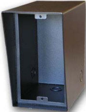
RIB300 = Rough in Box 300 for concrete walls with rain shield 69.99 US$

We still have or other great rough in boxes.