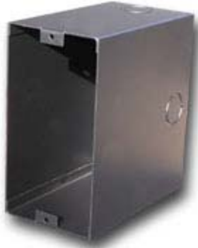
RIB200 = Rough in Box 200 for concrete walls 39.99 US$

Dealer pricing for our new RIB's are as follows: