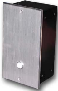
SAC50 Silver Illuminated Button