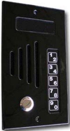
SAC200 Aluminum Powder Coat Black/Camera/Keypad