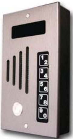
SAC200 Brass Oil Rubbed Bronze/Camera/Keypad/ Security Screws