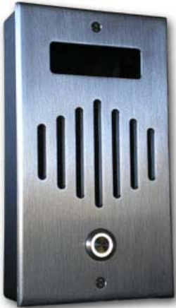
SAC100Aluminum Brush/ Illuminated button/Camera Security Screws