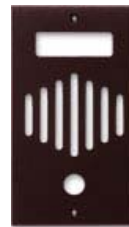
Brass Oil Rubbed Bronze