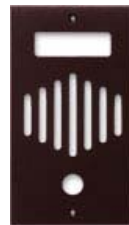
Brass Oil Rubbed Bronze