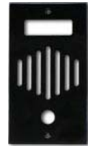
Aluminum Powder Coat Black