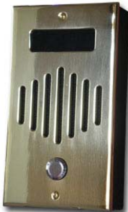
SAC100 Brass Polish/Camera