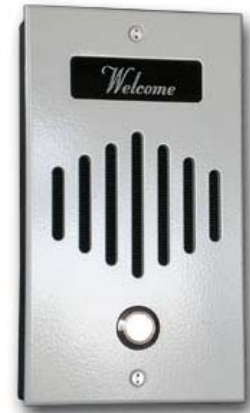
SAC100 Aluminum Powder Coat White/WNP/Security Screws