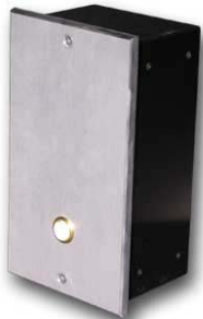
SAC50 Gold Illuminated Button