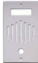
Aluminum Powder Coat White