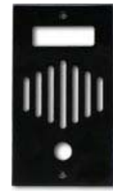
Aluminum Powder Coat Black