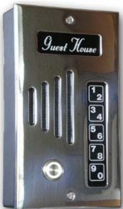
SAC200 Aluminum Polish/ Illuminated Button/CENP/ Keypad/Security Screws